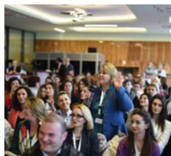
Participants in Week of Women 2015 discuss the role of women in the fight against corruption

UNDP continues to support the strengthening of the rule of law, including the development and establishment of a formal policy coordination and strategic planning process for the four key justice institutions: The Ministry of Justice, Kosovo Judicial Council, Kosovo Prosecutorial Council and Kosovo Judicial Institute. UNDP also helped the Basic and Appeal Courts in the unifi-