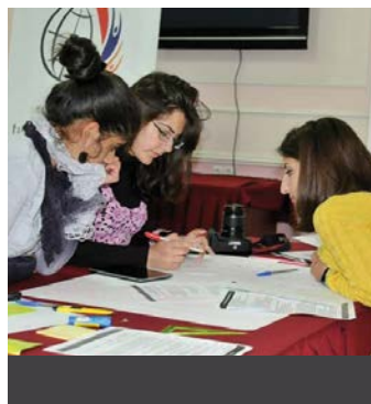
Kolba Labs: Encouraging social business idea development through teamwork

Innovation also played an important role as UNDP’s Kolba Lab led an initiative to increase public engagement with government. Through crowdsourcing, social innovation camps and hackathons, 20 citizen-led projects in local governance, human rights, and the green economy were generated. These projects are currently at various stages of prototyping and have involved around 350 active citizens, civil servants and members of civil society organizations.