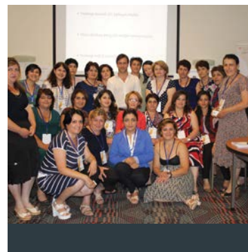
At the Women Leadership School organized by the UNDP 'Women in Local Democracy' project