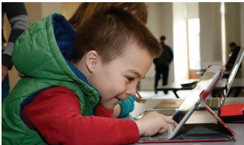
A young gamer plays 'Peace Park' – an online game developed as part of COBERM to encourage peace and cooperation in the South Caucasus