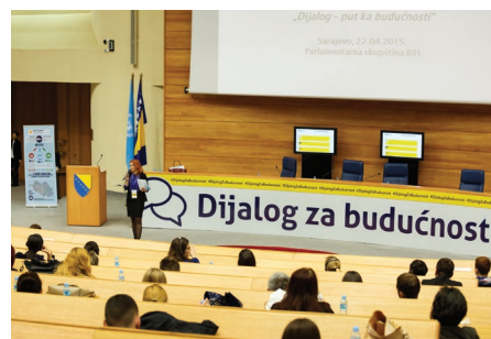
Dialogue for the Future conference in Sarajevo

Addressing the legacy of the conflicts in the breakup of the former Yugoslavia is also a focus of UNDP's engagement. In BiH, the Dialogue for the Future remains one of the flagship projects for reconciliation in the ECIS region, helping to address past grievances, bring together communities from different ethnic groups, and build understanding. To date, Dialogue for the Future has directly engaged over 54,000 citizens with Dialogue Platform Conferences, youth forums, trainings, and various grants facility projects. Similarly, in the former Yugoslav Republic of Macedonia, UNDP is working to reconcile differences between ethnic Albanians and Macedonians in Kumanovo and Gostivar. With the goal of strengthening social cohesion among youth living in multi-ethnic areas, in 2015 this work focused on establishing youth councils, with workshops, trainings, street art performances and debates to raise awareness of the councils, as well as bringing youth from different communities together.